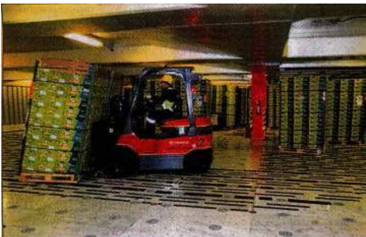
PACK IT IN: Kiwifruit are loaded on board the Sunbelt Spirit.