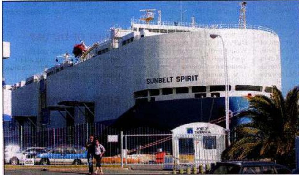
TOWERING: The Sunbelt Spirit is docked at the Port of Tauranga ready for loading kiwifruit. PICTURE / 060409MM60B0P