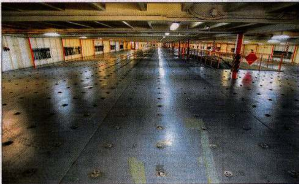
PLENTY OF SPACE: The empty car dock on the Sunbelt Spirit. PICTURE / 060409MM36B0P