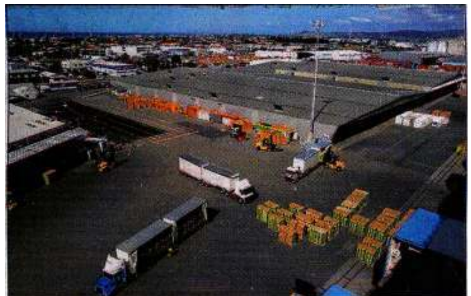
LOAD HER UP: 7500 pallets of green and gold kiwifruit are bound for the Belgium port of Zeebrugge.